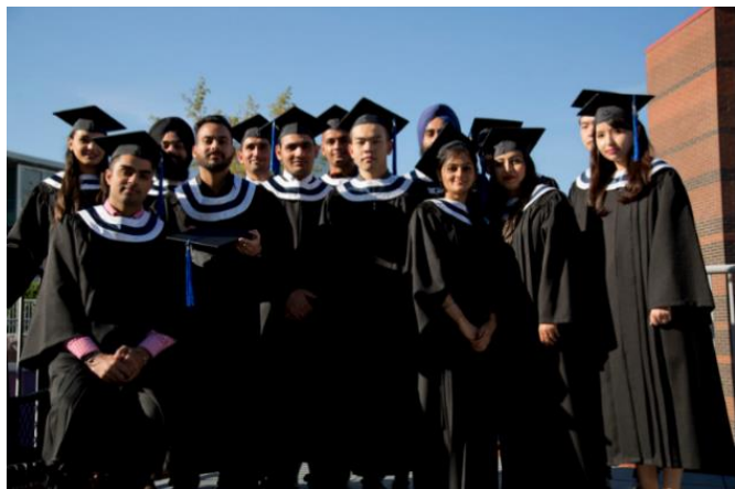
Fig. 1: Alexander College Graduating Class, Fall 2015.